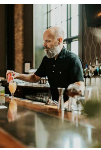
Full Bar Specialty Cocktails