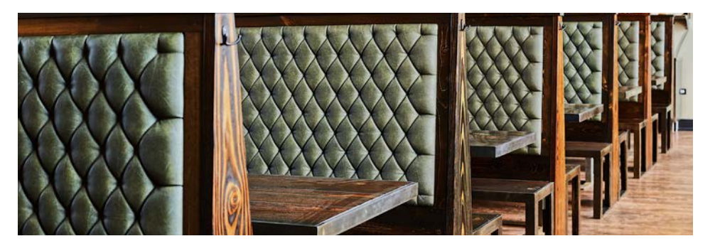
Booths and Tables from Structural Lumber