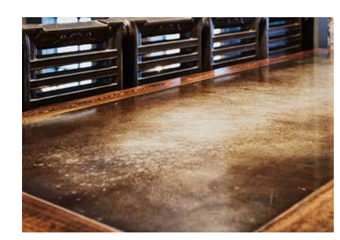
Custom Steel Table Tops