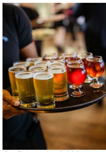
Craft Beer and Cider Made on Site