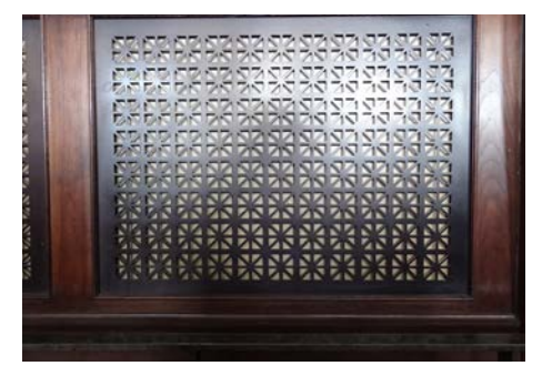
Reclaimed Grates at Bar