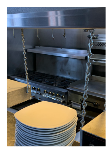
ERIS Kitchen Food from Scratch