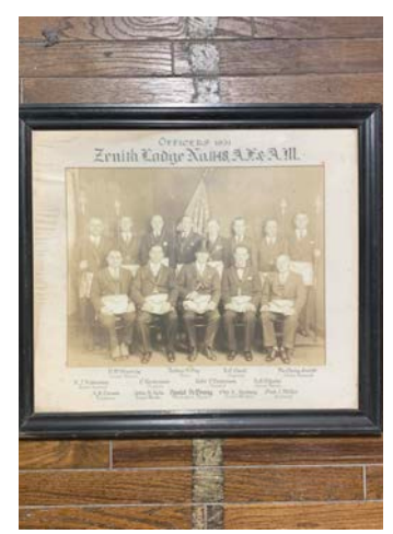
Unique Venue Historic Masonic Temple