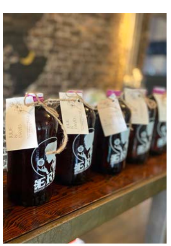
Add-ons Customized for You