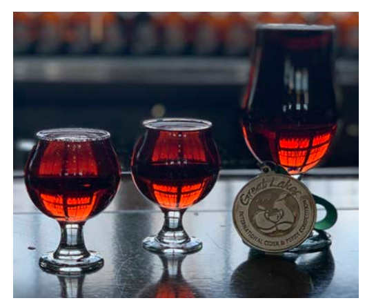
Van Van Mojo Cider

Creativity is foundational to ERIS, and ther are no shortcuts. Only the craft of creation for your enjoyment. Beyond crafting liquids we also craft experiences for you and your guests.