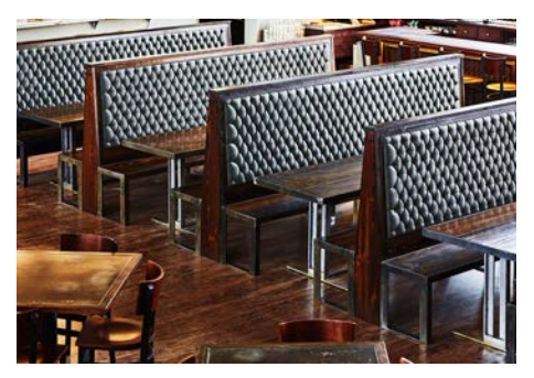
Extra Large Booths