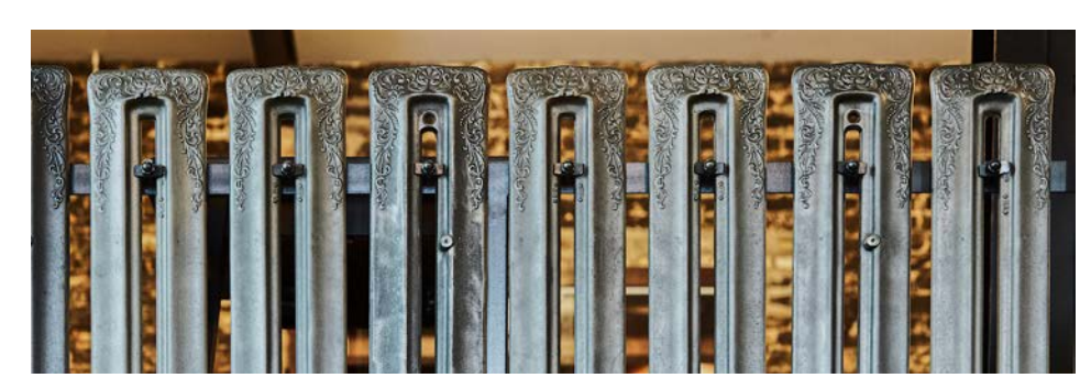
Original Radiators Repurposed as Railings